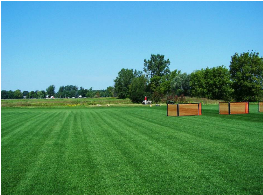
A view of the new Greenway Field – lots of wide open spaces!